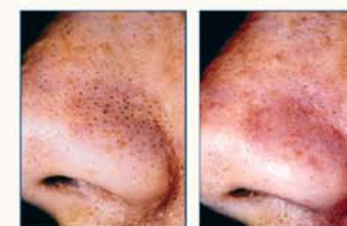
Before After Blackhead Removal After 1 Treatment