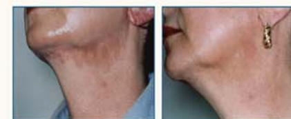
Before After Post Laser Blending After 4 Treatments