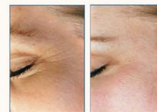
Before After Fine Lines & Wrinkles After 6 Treatments

The following photos show actual examples of results obtained by microdermabrasion: